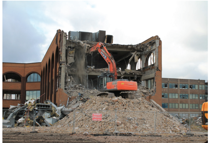
Image of construction work on site

You may have noticed some yellow signs reading 'Enderby Wharf' along Christchurch Way. These direct customers of the Marketing Suite and not construction traffic. They have been covered until the Marketing Suite is open.