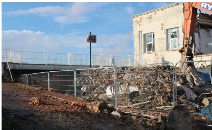
Image of construction work on site

In order to ensure that all construction traffic uses the Blackwall Lane gate Barratt London have reissued instructions to all subcontractors with the postcode SE10 0PL.