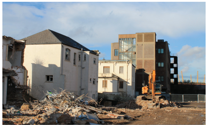
Image of construction work on site